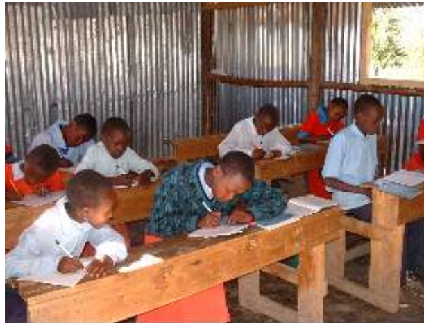
Studying hard during school at HCC

Our work is to encourage them, get them off the street and give them a home with hope and a future. (Jeremiah 29:11)